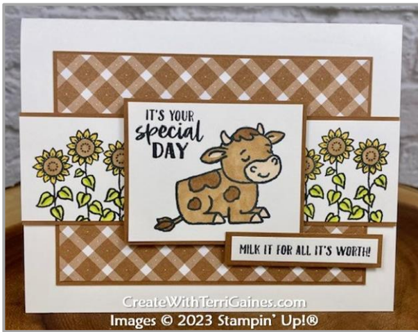
Card #1 – Stamps, Paper & Ink - This simple card is perfect for a beginner stamper or a quick card for someone on the go!