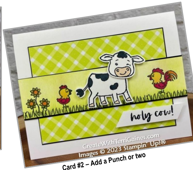
Card #2 – Add a Punch or two