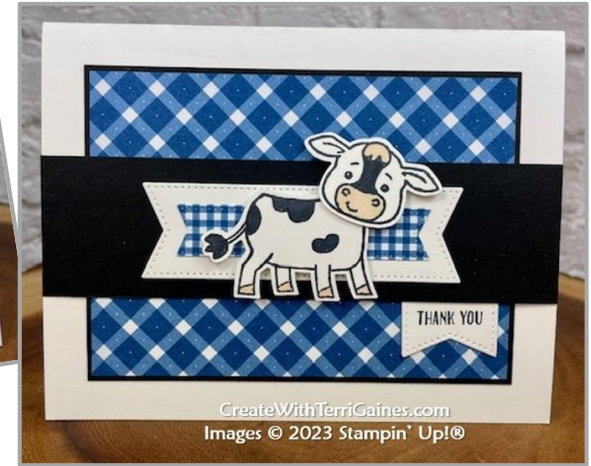
Card #3 – Using Cut & Emboss tools

Link to video tutorial: https://youtu.be/aBclAqYQ4R8