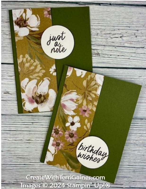
Card 1 & 2 Designer Paper: 2" x 5-1/2"