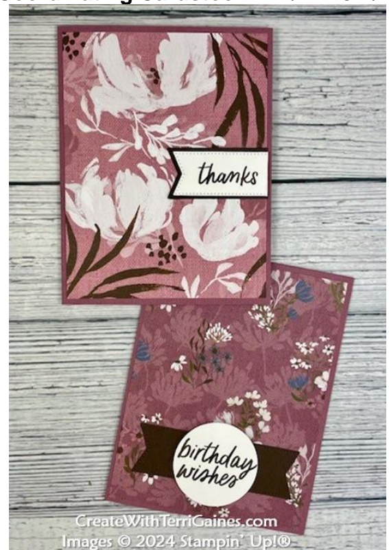
Card 7 & 8 Designer Paper: 4" x 5-1/4"