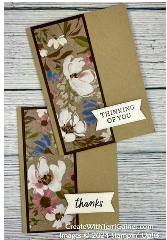
Card 3 & 4 Designer Paper: 2" x 5-1/4" Coordinating Cardstock: 2-1/4" x 5-1/2"