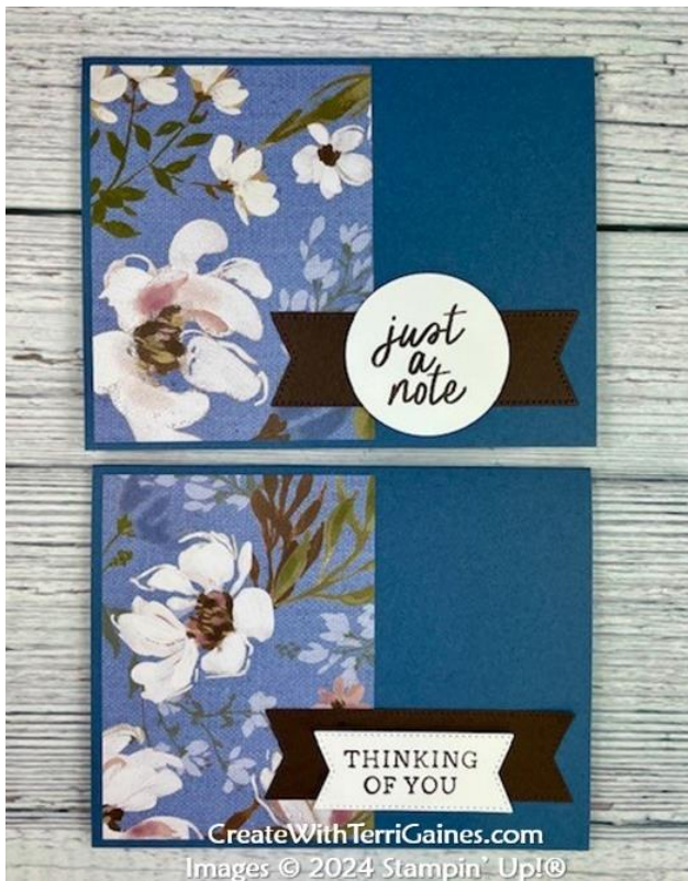
Card 5 & 6 Designer Paper: 3" x 4"