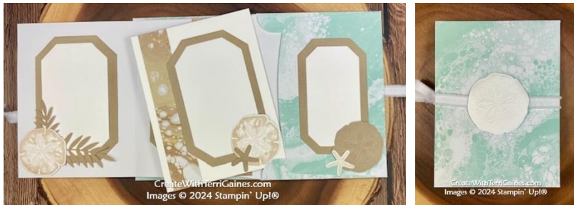
Showing Post Card in Envelope (right)