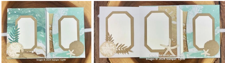
Card Base (left), Envelope (right) Card opened (left), Envelope (right)