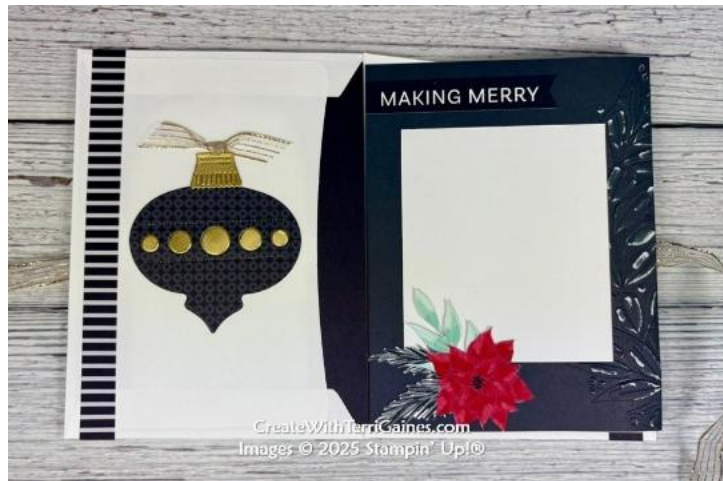
Inside: Envelope (left), Card Base (right)