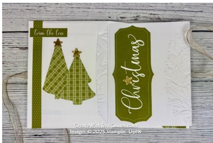
Inside: Envelope (left), Card Base (right)