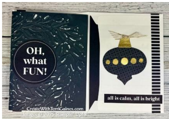
Card Base (left), Envelope (right)