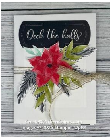
Envelope Book 1 - Front