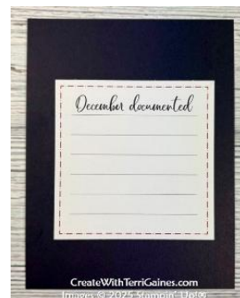
Post Cards: front & back (front envelope), front & back (back envelope)