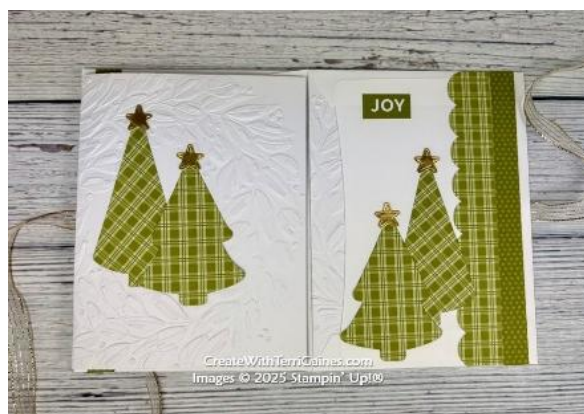
Card Base (left), Envelope (right) Card opened (left), Envelope (right)