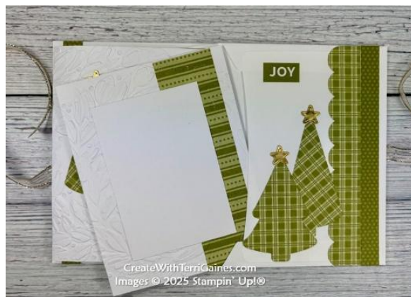
Showing Post Card in Envelope (right)