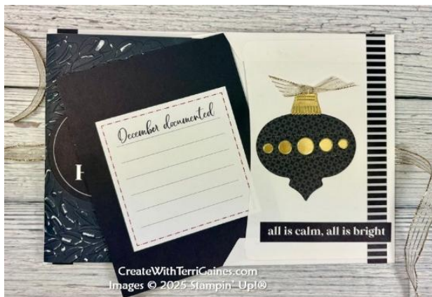
Showing Post Card in Envelope (right)