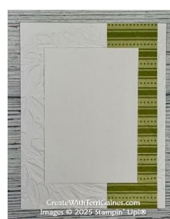
Post Cards: front & back (front envelope), front & back (back envelope)