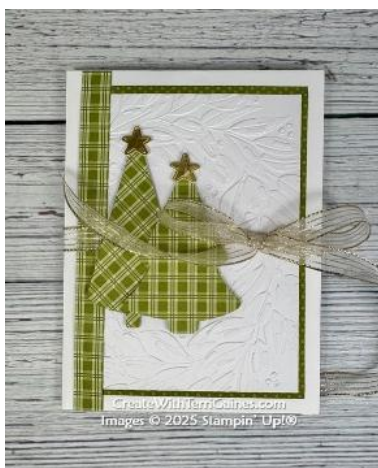
Envelope Book 2 - Front