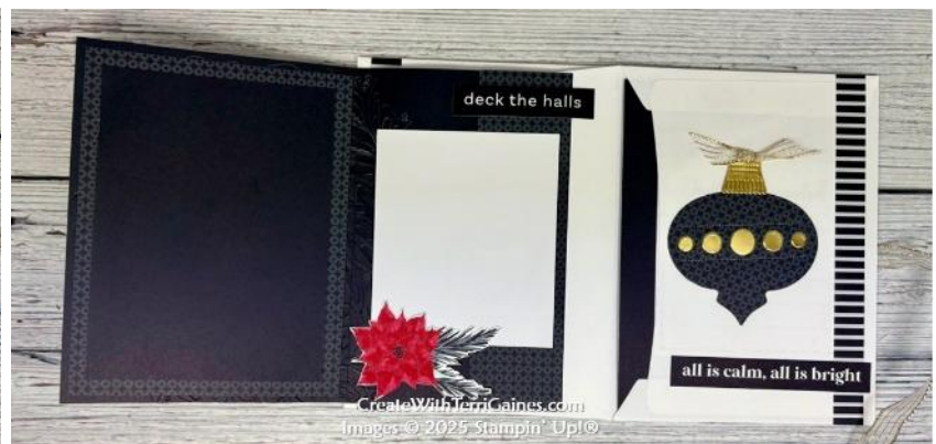
Card opened (left), Envelope (right)