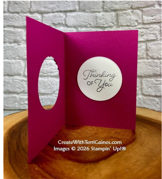
Card Base 2: 8-1/2" x 5-1/2" score 4-1/4"