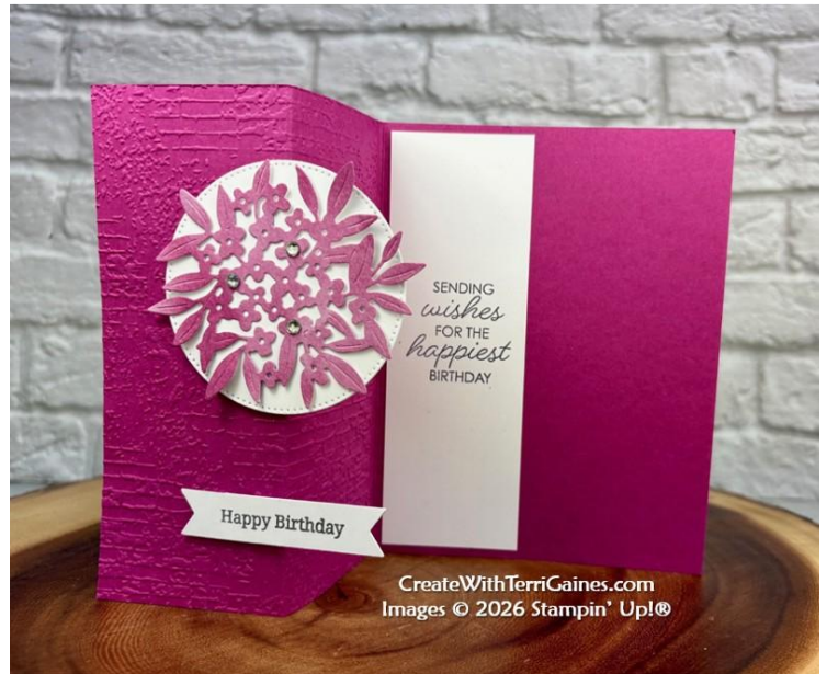
Card Base 1: 8-1/2" x 5-1/2" score 2-1/8" & 4-1/4"